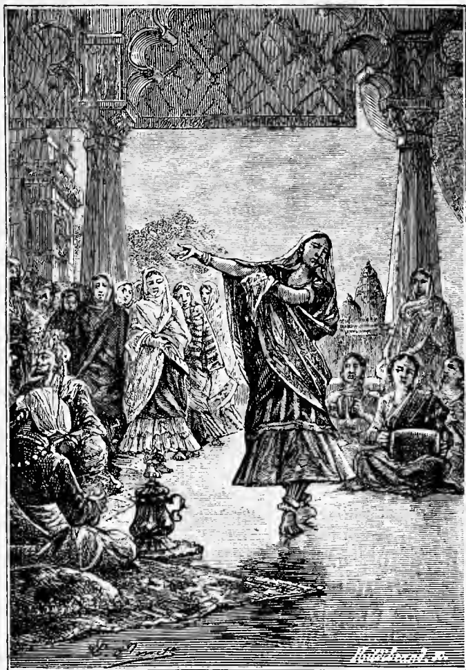
The bayadères at Bombay.